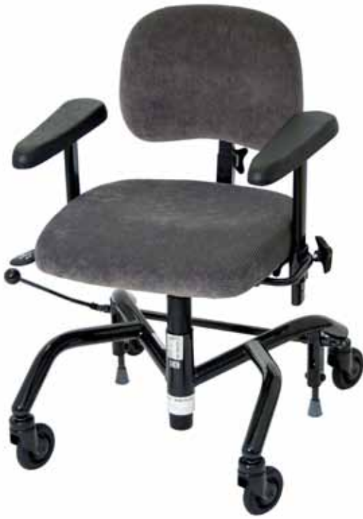
REAL 9000 PLUS