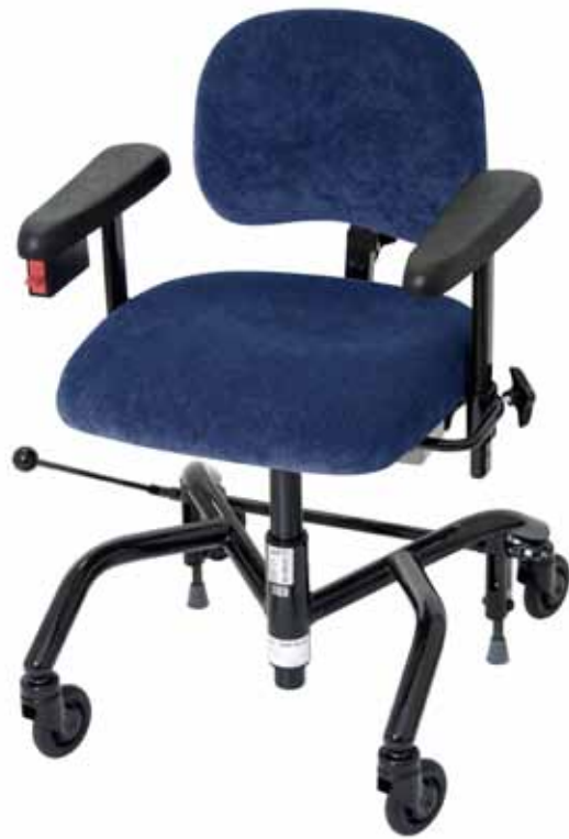
REAL 9100 PLUS EL