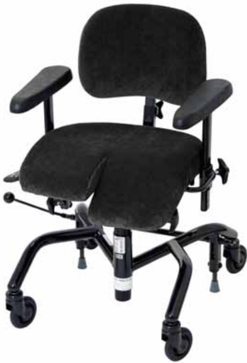
REAL 9700 PLUS COXIT