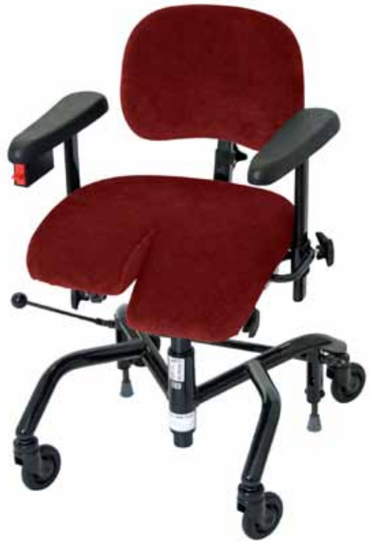
REAL 9800 PLUS COXIT EL